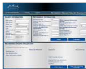
Retirement Needs Analysis Calculator