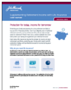
Client Snapshot (Client Approved)

For your clients who have protection needs and are also looking to supplement their retirement income in a tax-favored way, a permanent life insurance policy can provide a valuable solution. Refer to the following resources to learn more, and promote this concept with your clients.