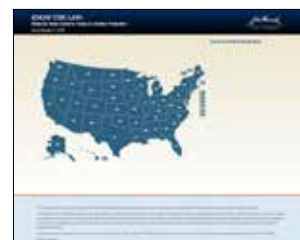
Know The Law

For agent use only. This material may not be used with the public.