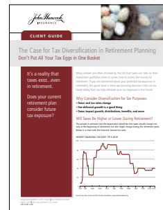
Tax Diversification Client Guide (Client Approved)